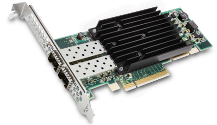
A new class of Smart NIC with the FPGA-like ability to inspect packets and shape traffic at line speed