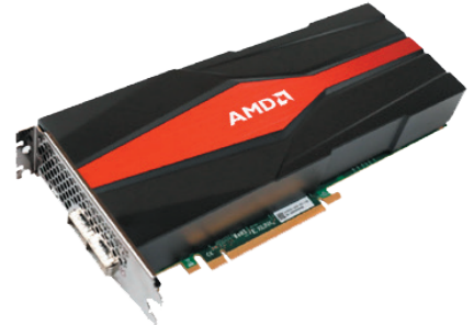
AMD VCK5000 Versal Development Card www.xilinx.com/vck5000