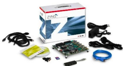
Xilinx Zynq-7000 All Programmable SoC ZC702 Evaluation Kit