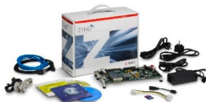
Xilinx Zynq-7000 All Programmable SoC ZC706 Evaluation Kit