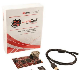
Avnet MicroZed™ Evaluation Kit